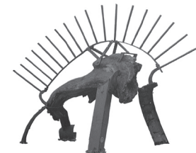
It's about art.